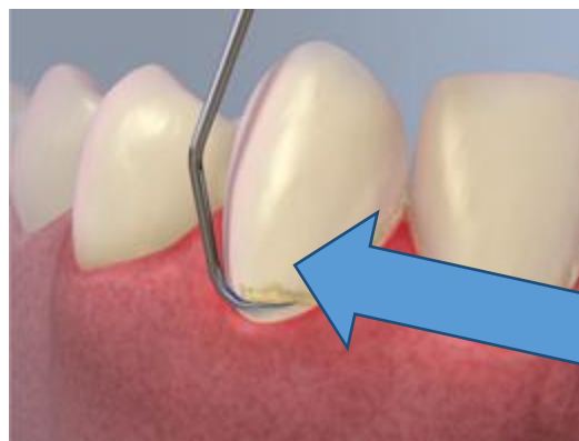
Scaling above the gums (supragingival).

The Board has approved duties that would authorize a Registered Dental Assistant under direct visual supervision or contiguous supervision (new definitions provided in rules) to provide anesthesia assistance to an oral and maxillofacial surgeon. An EFDA may also be authorized by permit to provide supragingival (above the gingiva) scaling; removal of build-up on the coronal surfaces of the teeth.